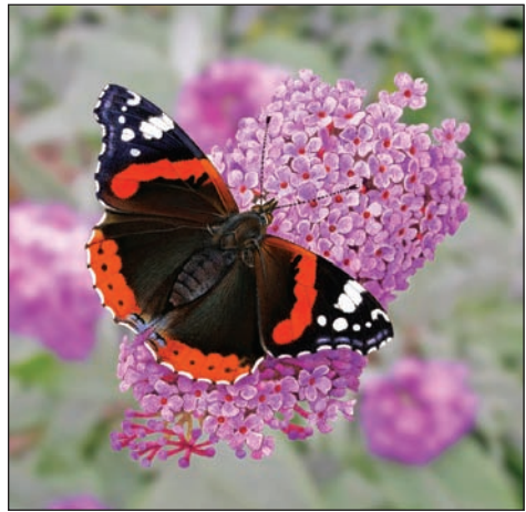
Comma Polygonia c-album and Red Admiral Vanessa atalanta . Stamp illustrations for the Isle of Man Butterfly Collection. Using a combination of painted butterflies on out of focus photographic backgrounds.

was recently re-published, together with the combination of careful scanning, good quality paper and being present at the printing with the publisher, it was possible to check the first prints before giving the final go-ahead. I'm convinced now that this is the best way to achieve the desired result, though if the book is being printed in Hong Kong rather than Britain this could be a problem.