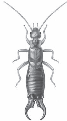
Common Earwig Forficula auricularia . Example of half-tone pencil drawing.