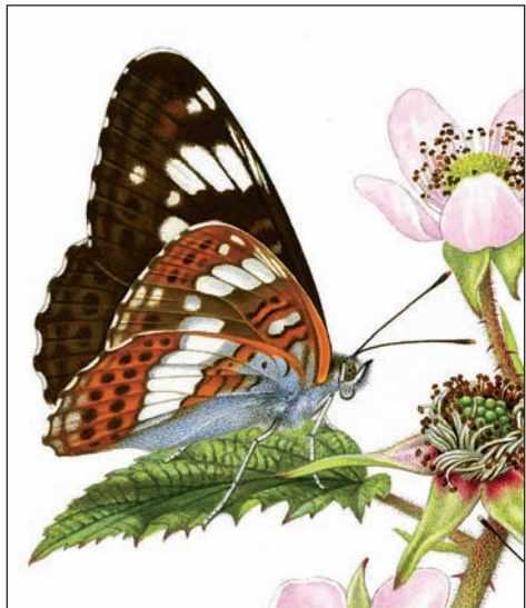
White Admiral Limenitis camilla . The finished painting, combining the previous photograph with a set specimen.