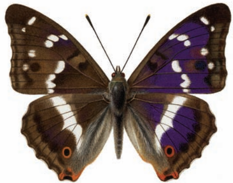
Purple Emperor Apatura iris . Using light to show how the purple iridescence appears on the opposite side from the light source. Although butterfly wings appear flat, light and shade is used to show how the veins and the folds between them protrude from and incise the surface respectively.

The convention when painting insects is to assume that the light comes from the top-left, thus creating a shadow with reflected highlights on the opposite side. Using this principle, textures, like the elytral pores of beetles, can be treated in exactly the same way, so as to show minute differences between similar species. Although light and shade are most important in describing form and texture, care must be taken, as markings and other fine details can be