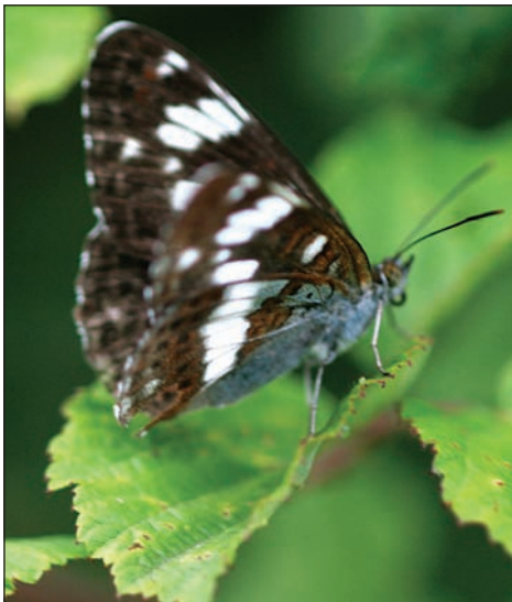
White Admiral Limenitis camilla . A poor photograph of a worn specimen, which is still useful as a reference for posture.