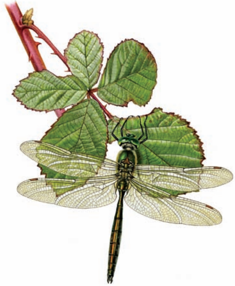
Brilliant Emerald Somatochlora metallica . Painting created using a museum specimen for fine anatomical detail, photograph for colour reference and bramble leaf for interesting textures and composition.

There is no question that with the rapid development of digital photography, books on butterflies and moths in their natural surroundings, with stunning photographs often taken by amateurs as well as professional photographers, are great show-pieces of their subjects. However, they serve a different purpose than the true identification field guide, and all things being equal can never compete with accurately painted and printed illustrations. For example, the recent photographic guide British Moths and Butterflies (Manley, 2008)