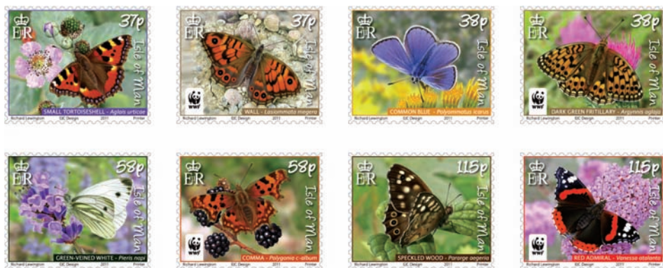
Isle of Man Butterfly Collection.

camera never lies and that photography uncompromisingly portrays images of actual specimens. I agree that photographs do not lie but details are often obscured and uniform lighting can flatten textures and form. Colours, particularly green in moths, may also be affected after death, and abdomens (important features in groups like clearwings) can become distorted, something that can be corrected with artwork. However, both photography and artwork can be unpredictable when reproduced, as can be seen in different editions of various guides, with an imbalance of colour or saturation sometimes affecting the final result.