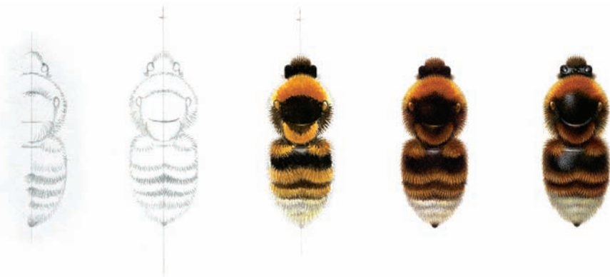
Bombus subterraneus . The progression from measured pencil drawing, to finished painting, showing head, thoracic and abdominal markings.