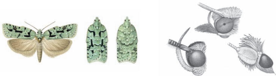
Left: Acleris littorana . Showing the rough lichen-like texture of the forewings. Right: Pencil drawings of micro-moth heads showing structure and texture without the need of colour.

obscured and confused, particularly by too much shading. Certain subjects, for example Odonata, pose particular challenges, and as venation is important in separating some species this has to be portrayed with care and in detail, as impressionism plays no role here. For the bolder veins a fine brush is used, but as the veins become increasingly finer a fairly hard, sharply pointed pencil is used for best effect. Condition of specimens may also cause problems, for example, some of the specimens used to illustrate the Field Guide to the Dragonflies of Britain and Europe (K-D Dijkstra, 2006) were sent dried and papered from Holland and a few arrived broken into several pieces. Here reconstruction was necessary and the injection of warm water into the specimens with a hypodermic syringe, to relax them, was occasionally necessary in order to reconstruct and set them before illustration could begin.