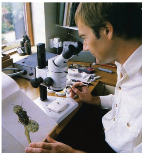
The artist at work.

The process for illustrating an insect in its natural posture is similar to illustrating that of the set specimen, though in some instances, particularly with micro-moths which often remain motionless, live specimens can be painted by carefully positioning them beneath the microscope—this always produces the best results. Failing that, a combination of set specimens (for the fine anatomical detail) together with photographs showing resting posture are usually used. I much prefer to show subjects in their natural postures, as we first see them in the wild or at rest in the moth-trap. However, in some instances an illustration of a moth or dragonfly at rest is insufficient to separate it from similar species, in which case a combination of illustrations, including details such as an underside, hindwing or head-on view may be helpful. This is demonstrated in several instances in Field Guide to the Moths of Great